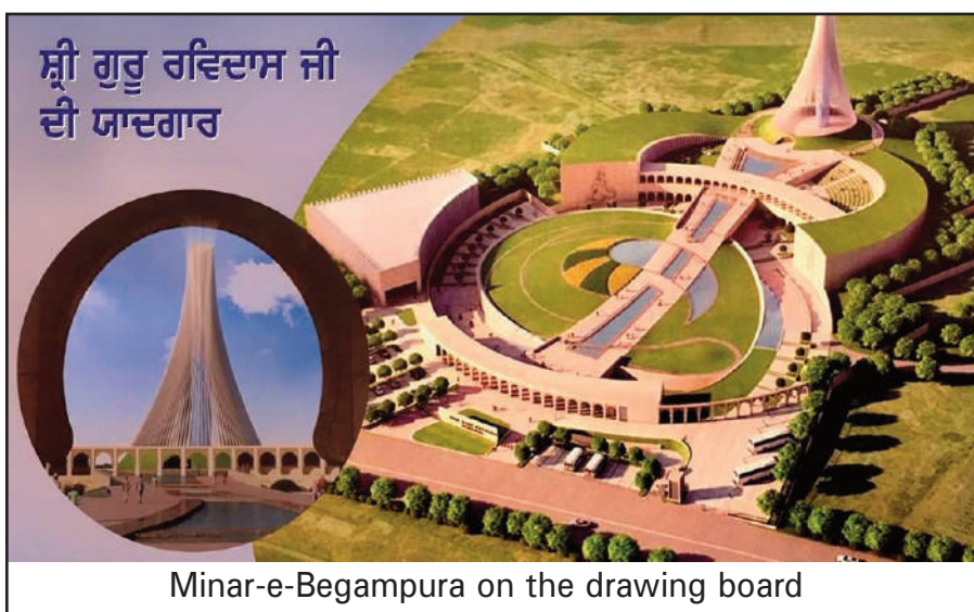
Minar-e-Begampura on the drawing board